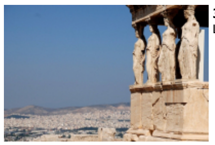
3 - Lagkadia - GS Traveler Moto Rentals - 229 Lagkadia to Athens via Dimitsana

Come across a wonderful lake which will be the setting as you return to your hotel. Spectacular motorcycle route, old bridges and provincial roads make this a wonderfully relaxing experience.