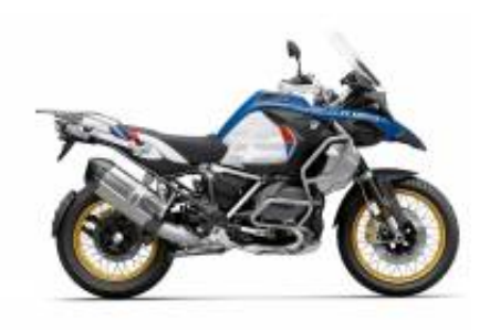
R 1250 GS Adv LC + $194.16