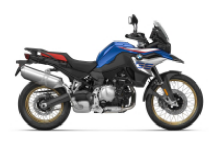
F 850 GS + $97.08