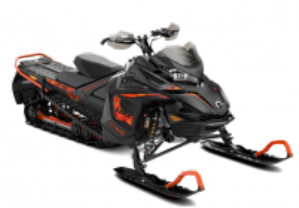
Lynx Xtrim 800 + $325.67