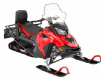
Lynx Adventure LX 600 ACE 2019 + $0.00