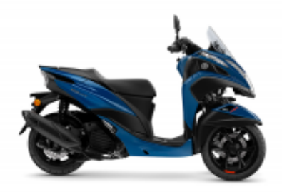
Tricity 125 + $10.87