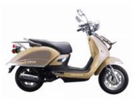
Lion 125 + $0.00