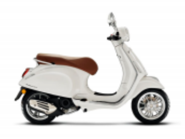
Primavera 50 + $10.87