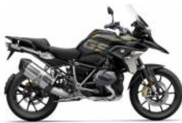
R 1250 GS LC + $86.87