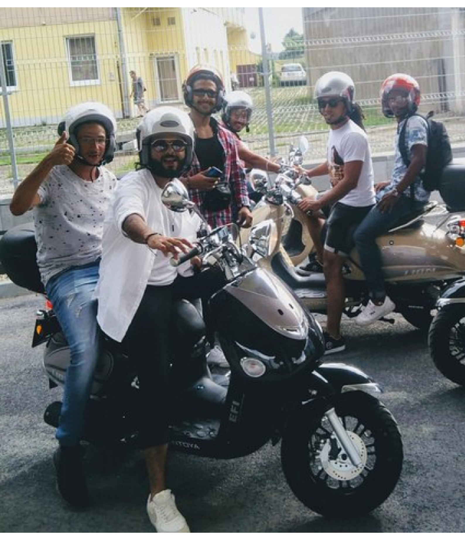
Motorcycle touring and cruiser tour discover Prague 1 day (audio guide)