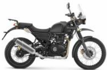
Himalayan 411 + $0.00