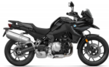
F 750 GS + $0.00