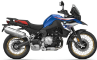
F 850 GS + $571.96