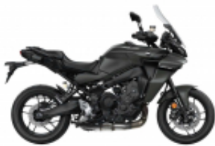
Tracer 900 GT + $0.00