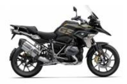
R 1250 GS LC + $129.71