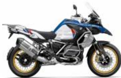
R 1250 GS Adv LC + $259.80