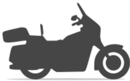
الدراجة النارية الخاصة بي + $0.00