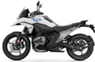
R 1300 GS 2024 + $1,482.66