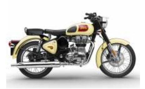
Classic 500 + $53.54