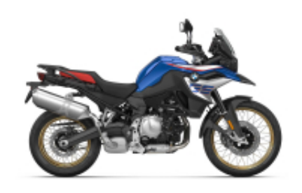
F 850 GS + $320.34