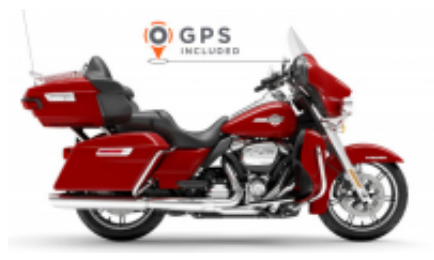
Electra Glide Ultra GPS Incl. + $0.00