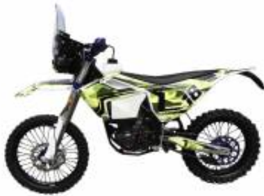
Rally 450 + $0.00