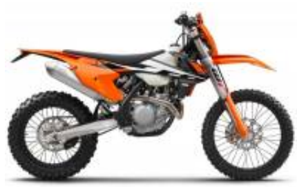
EXC 450 + $0.00