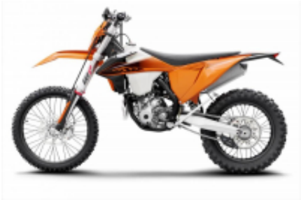
TPI/Six Days 300 + $0.00