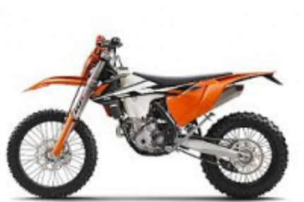
EXC 350 + $0.00