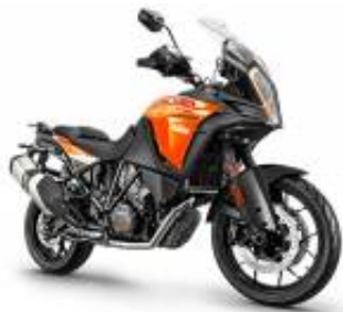
1290 Adventure S + $0.00