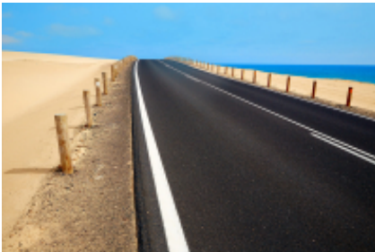
4 - Corralejo - - 0