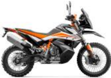
790 Adventure + $0.00