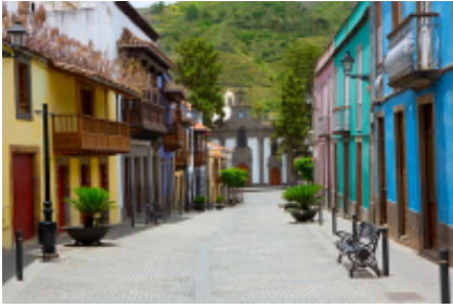
1 - la Grande Canarie - - 0