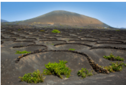
5 - Lanzarote - Lanzarote -