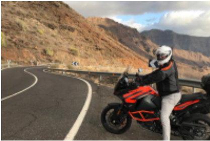
2 - la Grande Canarie - Fuerteventura - 250