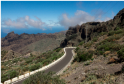
3 - Morro Jable - Corralejo - 250