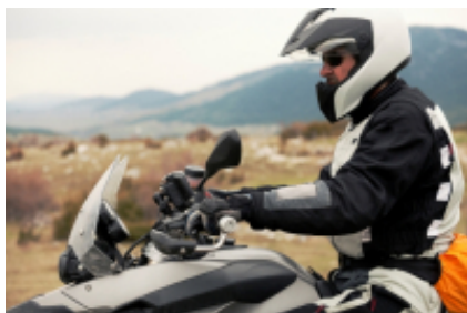
2 - Nauplie - Athènes - 170