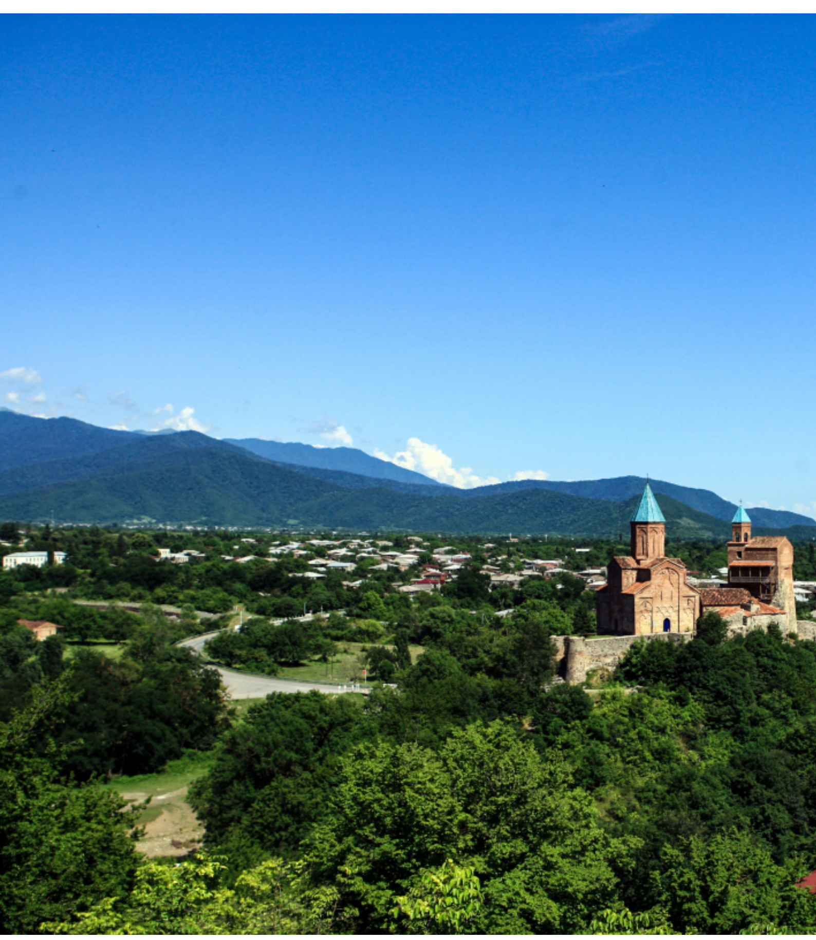
Bicycle Tour The amazing Georgia.