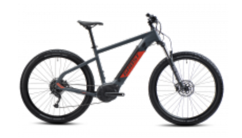
KATO + $0.00