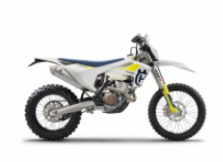
TE 350 + $0.00

2 0, 000000100000 2 0, 00000020000 1 0, 000000100000