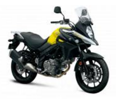
DL 650 V Strom + $0.00