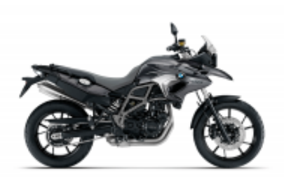
F 700 GS + $182.02