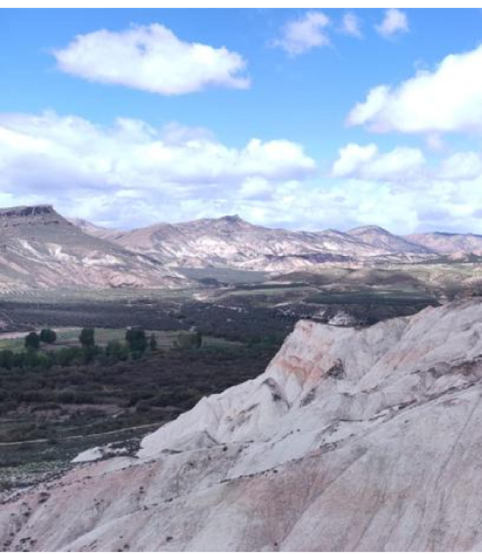
Motorcycle Enduro off Road tour Granada and Gorafe desert