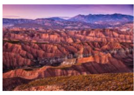
4 - Baza - Baza - 0

Gorafe Challenge. We hope you have a good rest. Don't forget breakfast, the repairable things, one of the hardest routes of the route awaits you. All kinds of surprises and challenges await us along the way: broken rock tracks, paths between trees, descents along animal trails and technical steps. Departing from Granada, we cross Beas de Granada, we pass through Huetor Santillan, Purullena and Guadix. The Gorafe desert and the 'badland' of Negratín is an extreme, unique landscape, unlike Andalusia, portrayed a thousand times in tourist guides. Nothing in Granada is more unique and remote. We will pass through places definitively forgotten by human activity. We eat at Rest Cueva Tio Tobas leg of lamb. We continue the route towards Baza. We slept at Cortijo Berchel. An incredible place in the middle of the desert. Full gasoline!