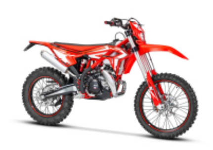
X Trainer 300 + $532.93