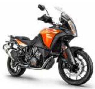
1290 Adventure S + $1,320.00