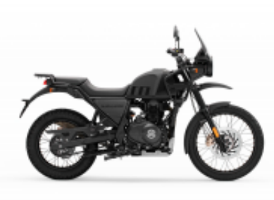
Himalayan 400 + $510.00