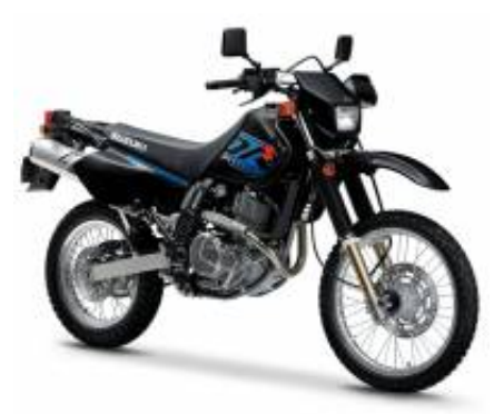
DR 650 + $678.00