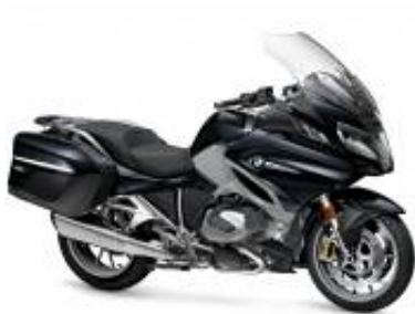
R 1250 RT LC + $489.32