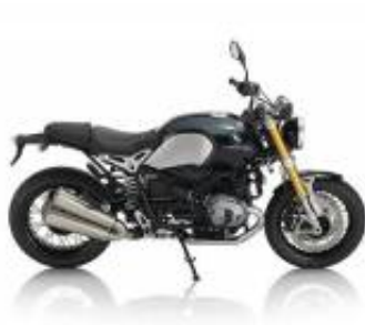
R Nine T Pure + $163.11