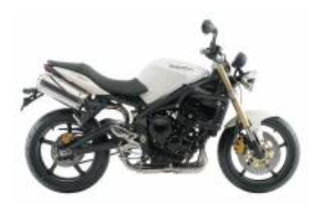
Street Triple 675 + $850.00