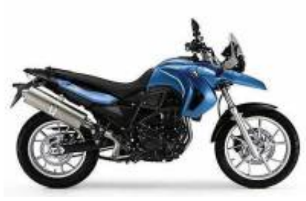
G 650 GS Twin + $850.00