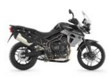
Tiger 800 XRX + $850.00