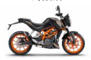
Duke 390 + $0.00