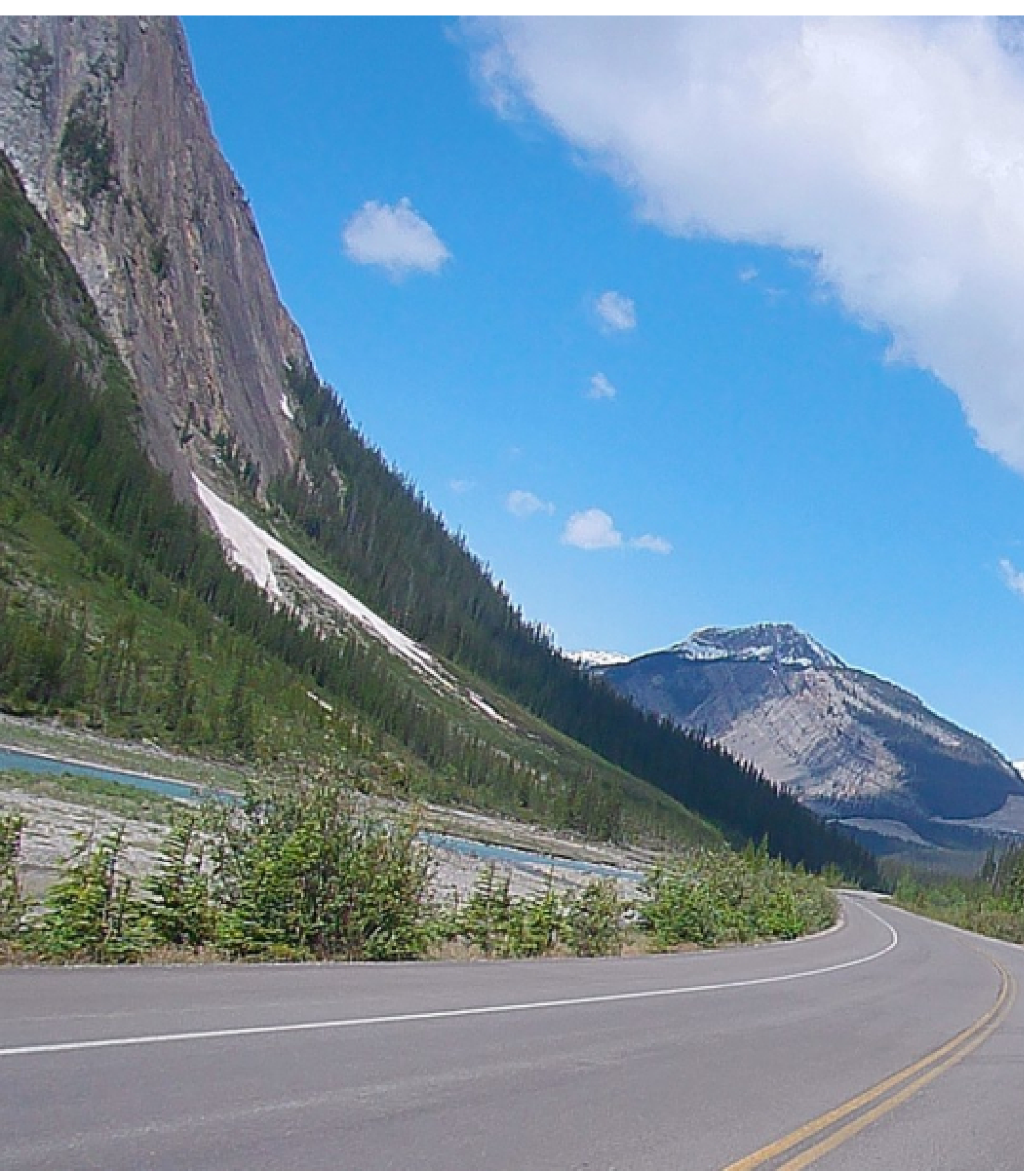
13-days on the Canadian Rocky Mountain Trials