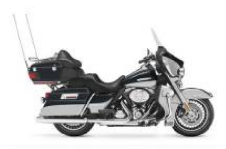
Ultra Glide Limited Touring Class + $850.00