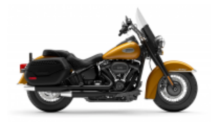
Heritage Softail Classic Class + $850.00