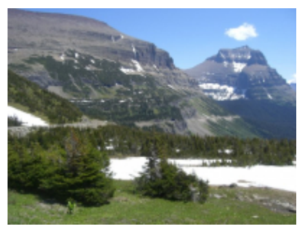
13 - - -

Day #12. 275 km / 165 mi (Approx. 2:00 hrs. riding) Riding north through the open prairies brings you to the "Bad Lands" of Alberta. A stop at a museum displaying the area and the dinosaurs that roamed the land at one time allows you get an up-close understanding of them. Leaving the town and riding west through canyons brings you back to Calgary and your stop for the night. A group farewell dinner brings this day to pleasant close.