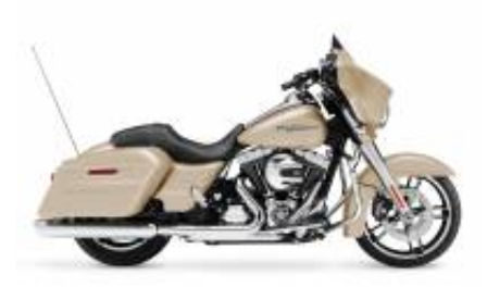
Street Glide Special + $850.00