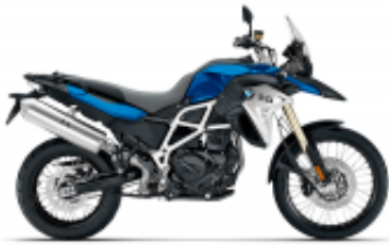
F 800 GS + $266.47