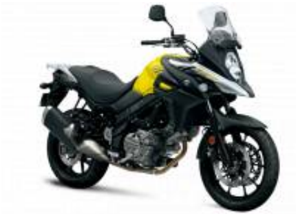
DL 650 V Strom + $0.00