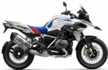
R 1250 GS + $746.10