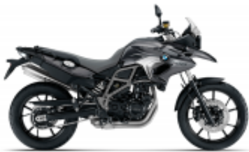
F 700 GS + $181.20