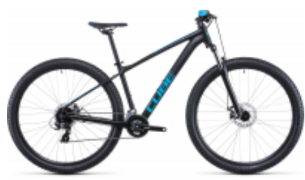
AIM 29er + $171.74