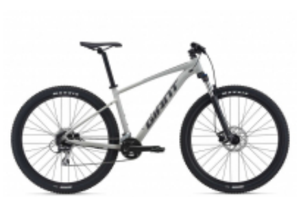
Talon 2 29 + $171.74