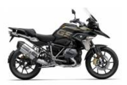
R 1250 GS LC + $500.00