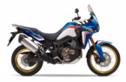
Africa Twin CRF 1000 L + $450.00