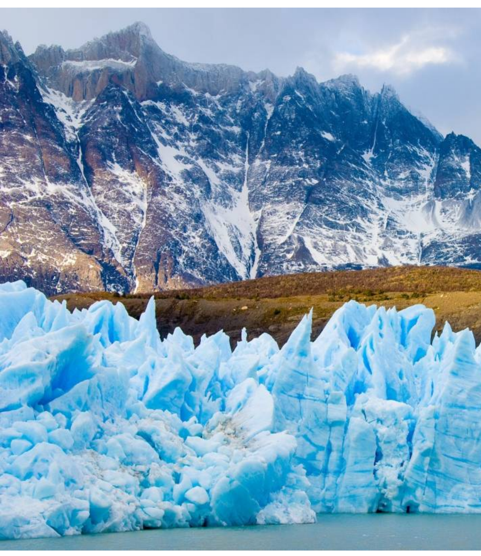
Motorcycle dual-purpose and Adventure Patagonia from Osorno to Punta Arenas guided