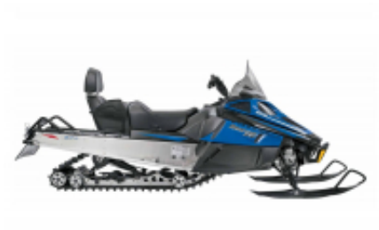
Bearcat XT + $0.00