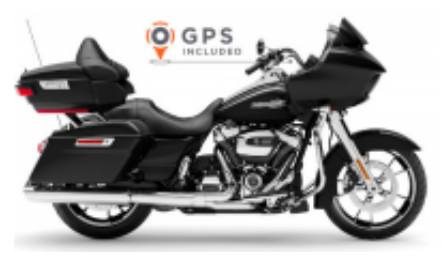
Road Glide GPS incl. Touring Class + $0.00