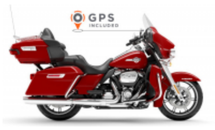
Electra Glide Ultra GPS Incl. + $0.00