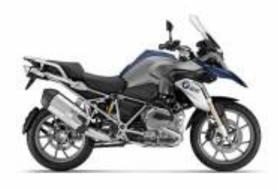
R 1200 GS + $450.00