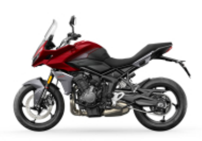
Tiger 660 Sport + $0.00