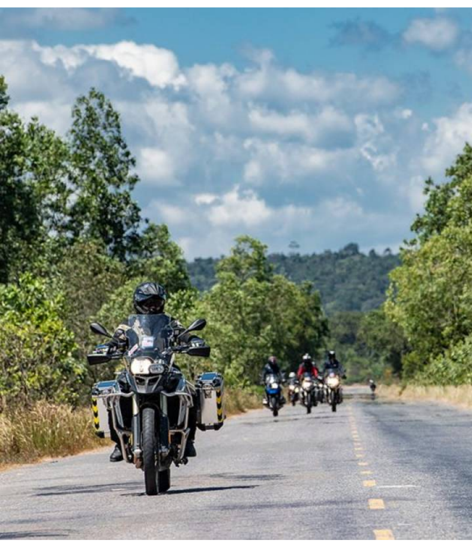
Motorcycle dual-purpose and Adventure Thailand, Amazing Land of Lanna