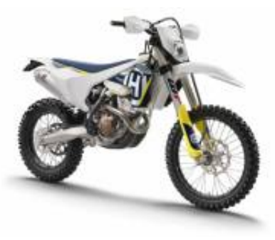
250 Enduro + $0.00