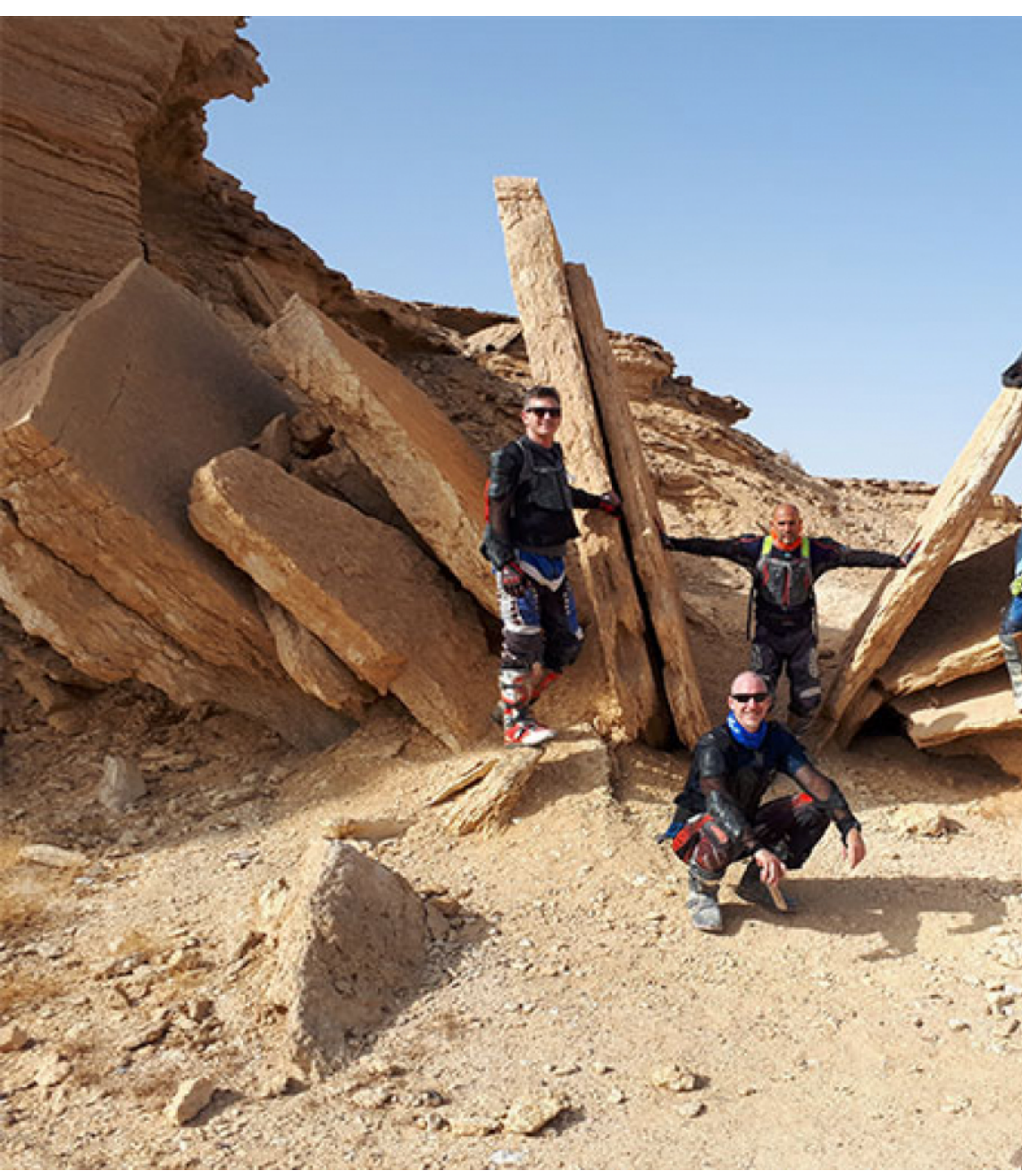
Motorcycle dual-purpose and Adventure Israel Cross deserts