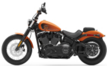
Street Bob + $0.00