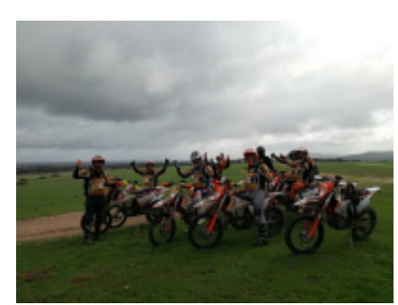
3 - Évora - Évora - 204

Breakfast at 8 in the morning followed by briefing to do a summary of the stage and a training in GPS handling. Departure at 9.00. We leave from Évora towards East. We await paths that meander the vineyards and wineries of the region of Reguengos de Monsaraz. From here we will continue to the impressive village of Monsaraz, which was conquered from the Moors in the 12th century along the banks of Lake Alqueva. Lunch awaits us on the contemplative margins of the Great Lake! After lunch we will have a mix of winding paths with other more open and rolling, some typical sections of the Baja de Reguengos. Near Evora, the gentle and undulating paths of the Alentejo plain begin to ask for a cold beer.