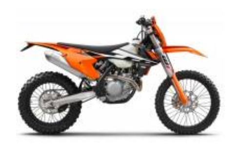
EXC 450 + $0.00