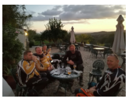
4 - Évora - Évora - 215