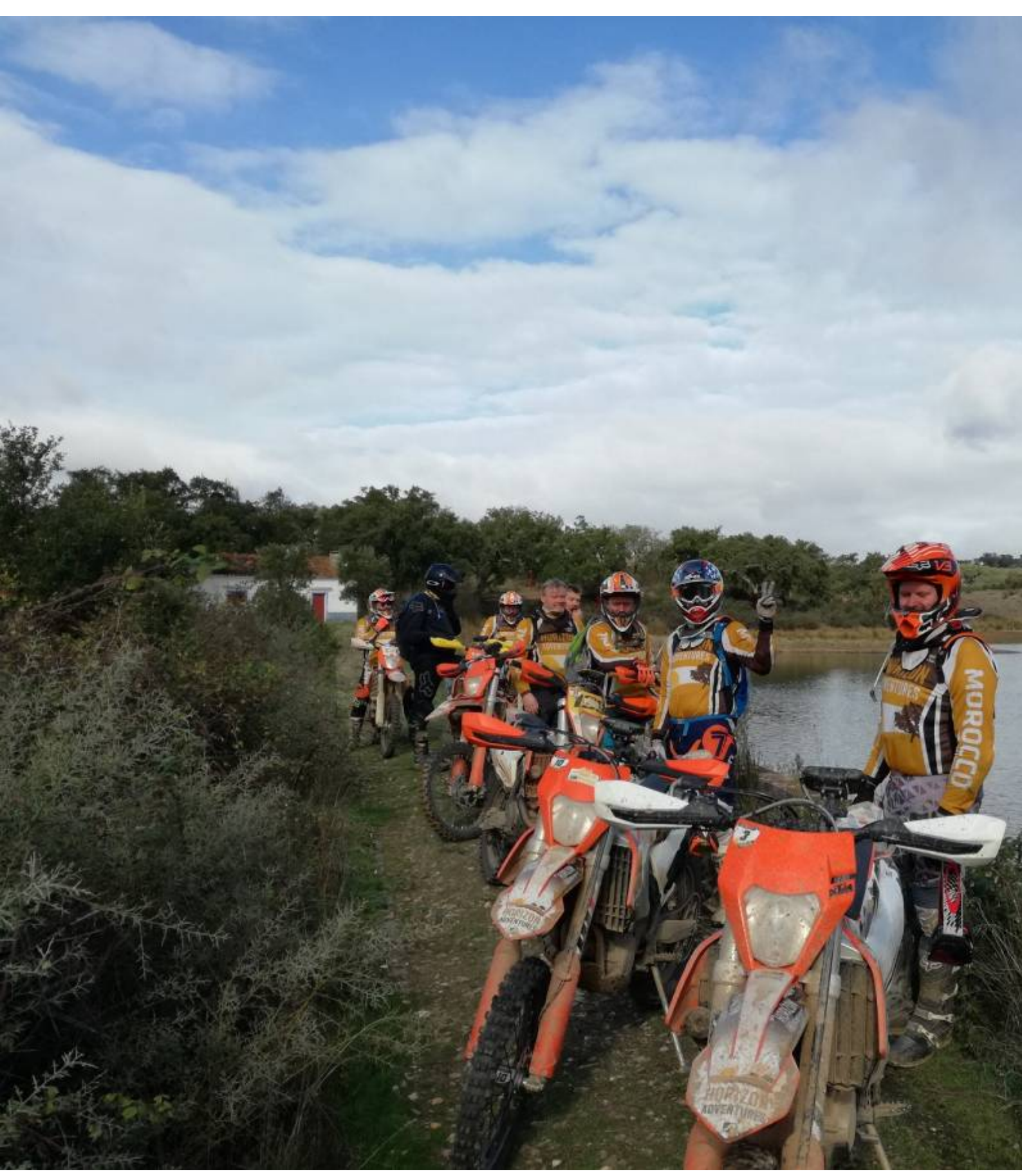
Motorcycle Enduro off Road tourepic Montargil, Enduro off Road Portugal