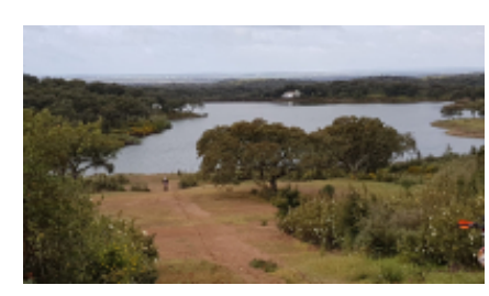
2 - Évora - Évora - 191 Évora - Monsaraz - Évora: 191 kms

Dinner will be held at the hotel and we will make an initial briefing related to safety standards and behavior during the Tour.