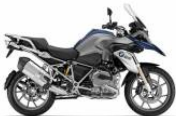
R 1200 GS + $1,350.00