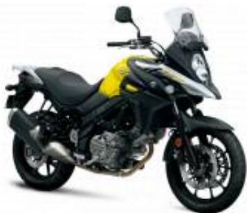
DL 650 V Strom + $0.00