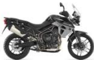
Tiger 800 XRX + $600.00