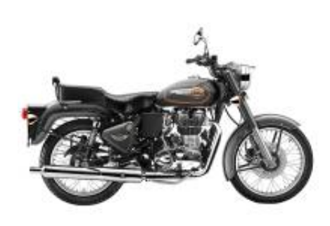
Bullet 500 + $53.59