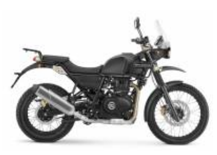
Himalayan 411 + $107.18