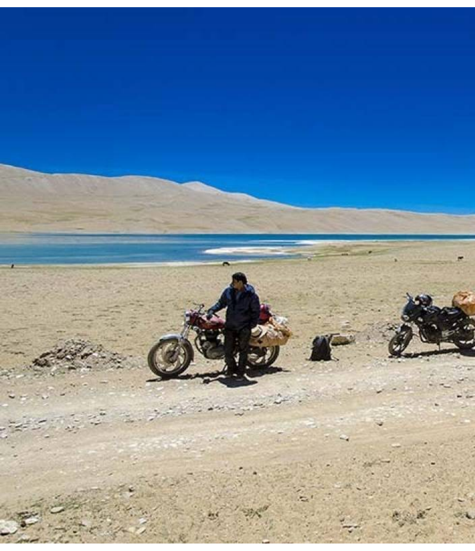
Ladakh Motorcycle dual-purpose and Adventure (Ex - Delhi)