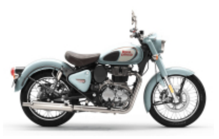
Classic 350 + $0.00