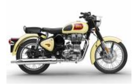
Classic 500 + $53.59