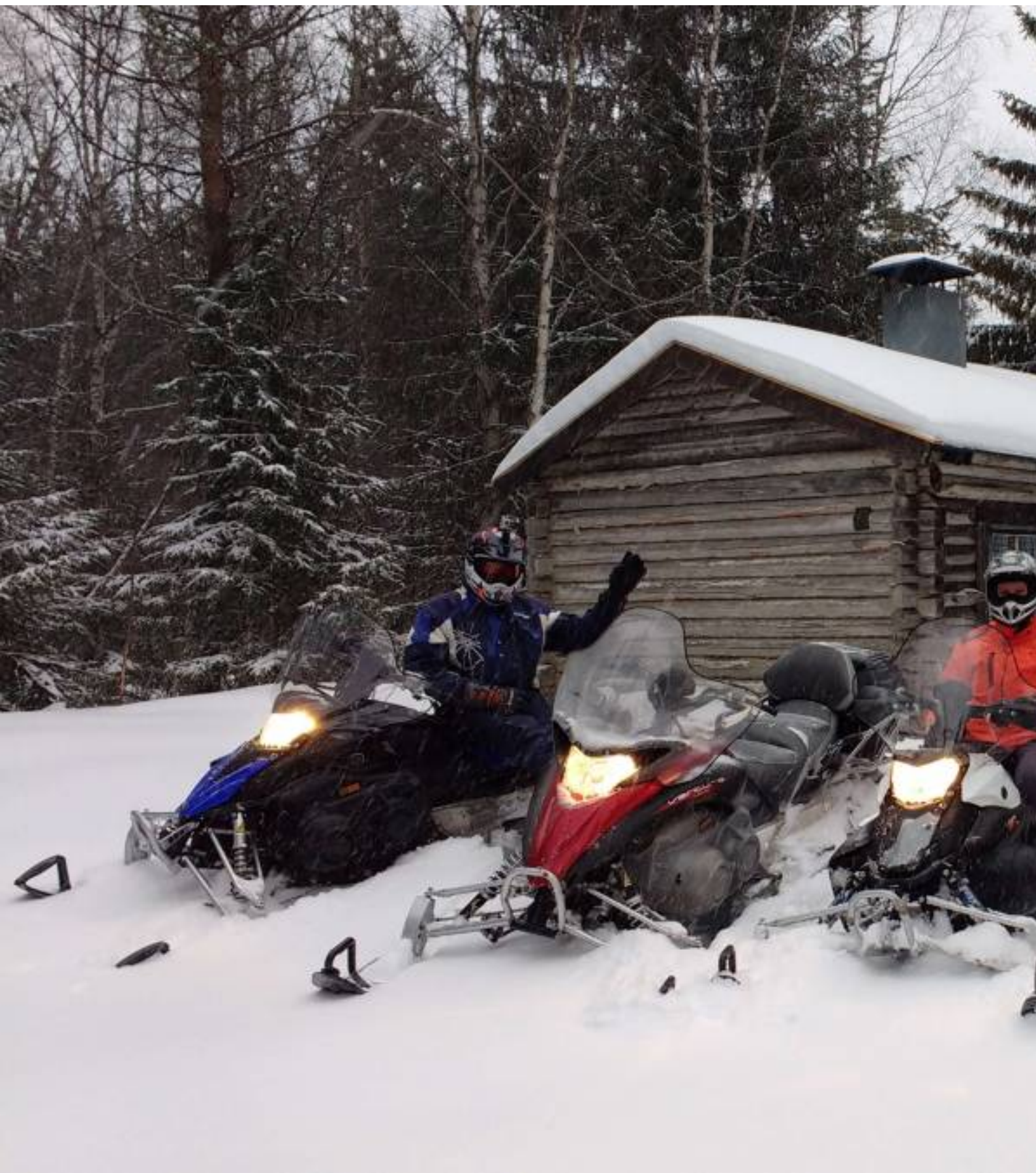
Snowmobile tour Sweden Polar circle