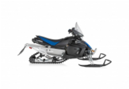
Viking 700 + $0.00