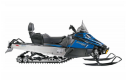
Bearcat XT + $0.00