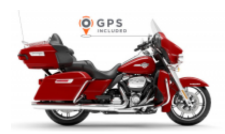
Electra Glide Ultra GPS Incl. + $0.00