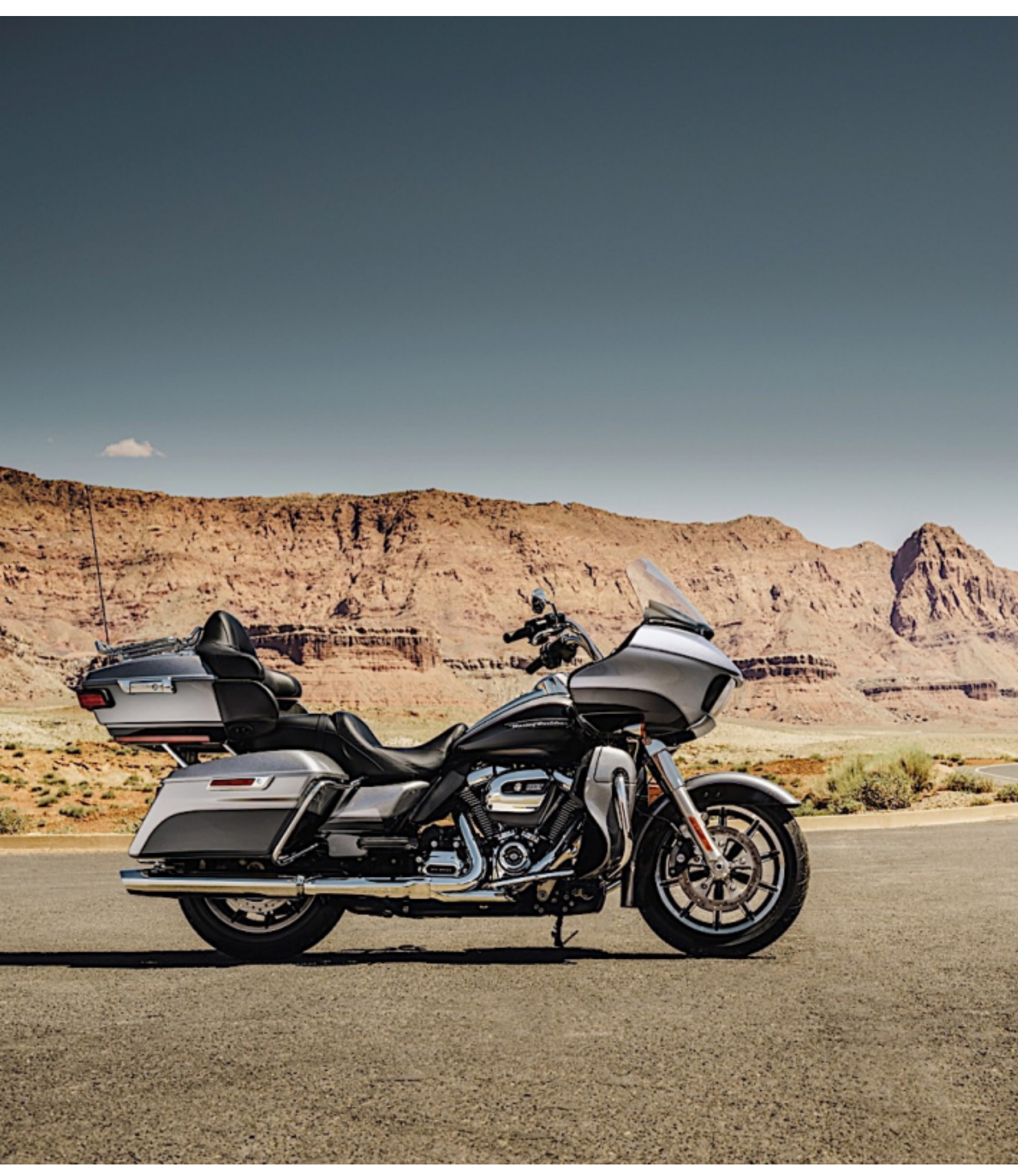
Motorcycle touring and cruiser tour Half Route 66 self guided