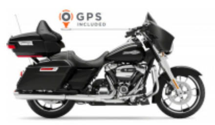
Street Glide GPS Incl. Street Touring Class + $0.00