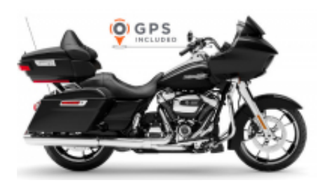
Road Glide GPS incl. Touring Class + $0.00