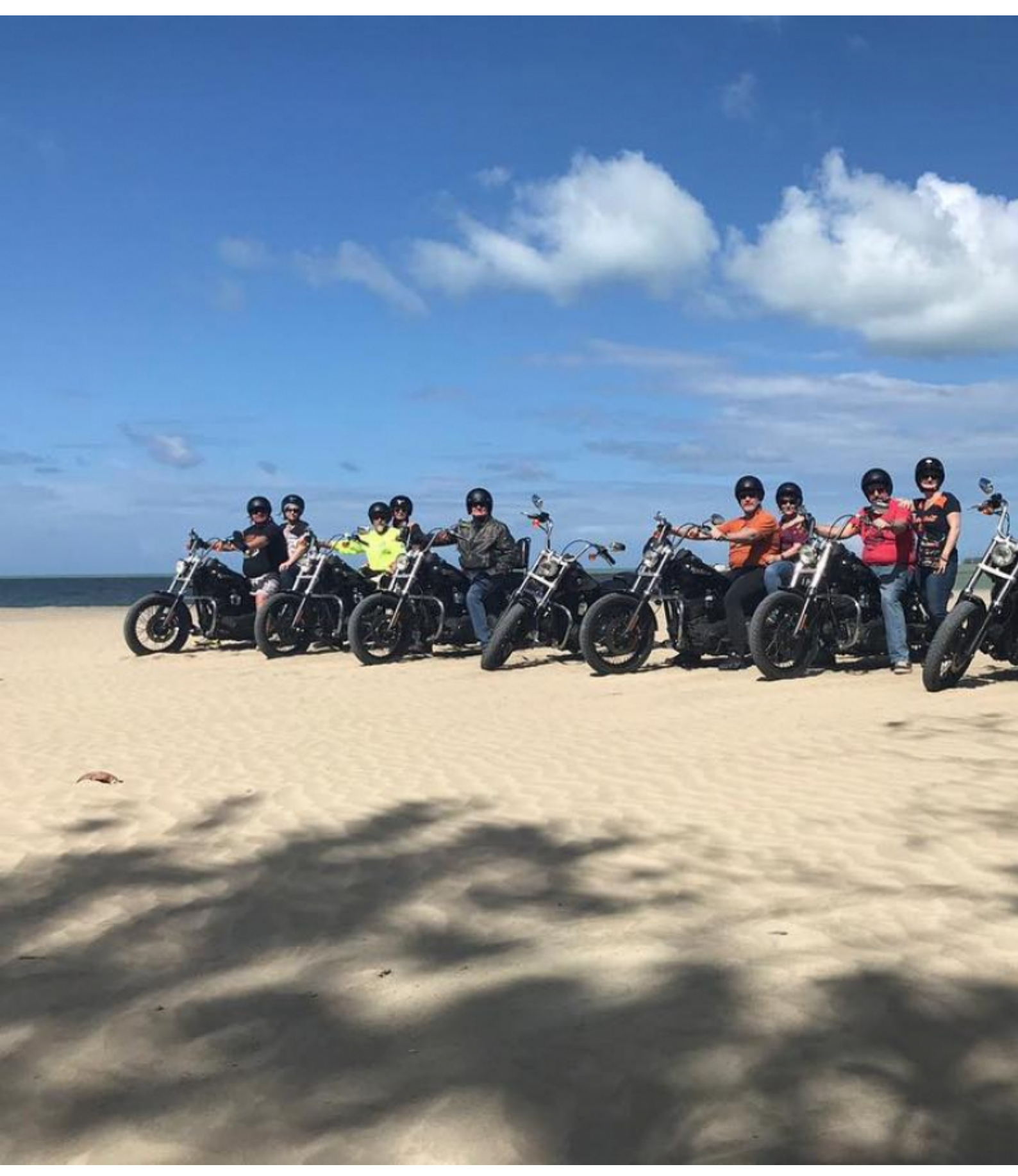
Motorcycle touring and cruiser tour, Dominican Republic