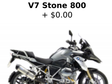
R 1200 GS LC + $481.86