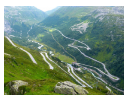
2 - Milan - Splügen - 206

Motorcycle driving in Self Drive mode, accommodation in designated hotels with bed and breakfast \,