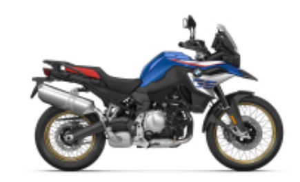
F 850 GS + $267.70