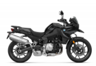
F 750 GS + $0.00