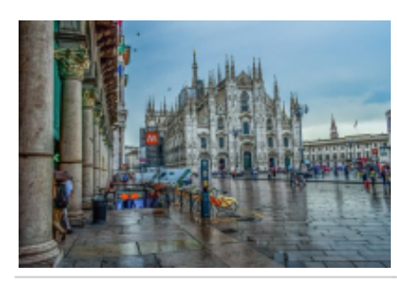
1 - Milan - Milan - 0 Arrive in Milan, hotel transfer by yourself