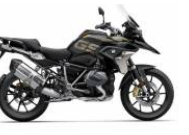
R 1250 GS LC + $535.40