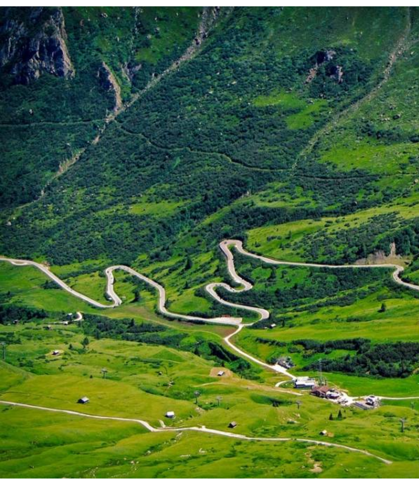
Motorcycle dual-purpose and Adventure, Alps Italy & Swiss self guided