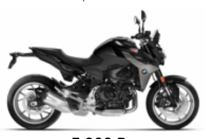
F 900 R + $0.00