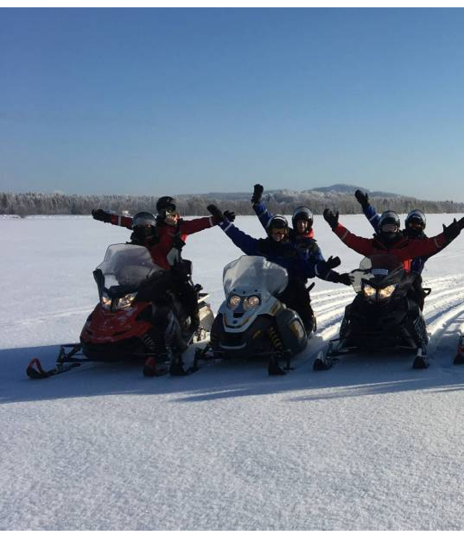
Snowmobile tour Safaris in Finnish Lapland