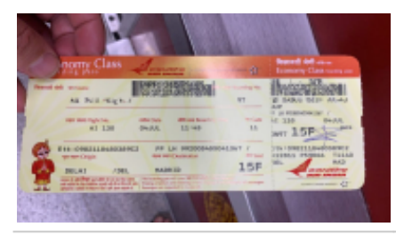
14 - New Delhi - Spain -Return flight Delhi to Madrid Outputs generally dawn Delhi are between 00: 30h and 3: 30h.

The room will be available until 12.00 then stay a room to shower or wash up before going to the airport.