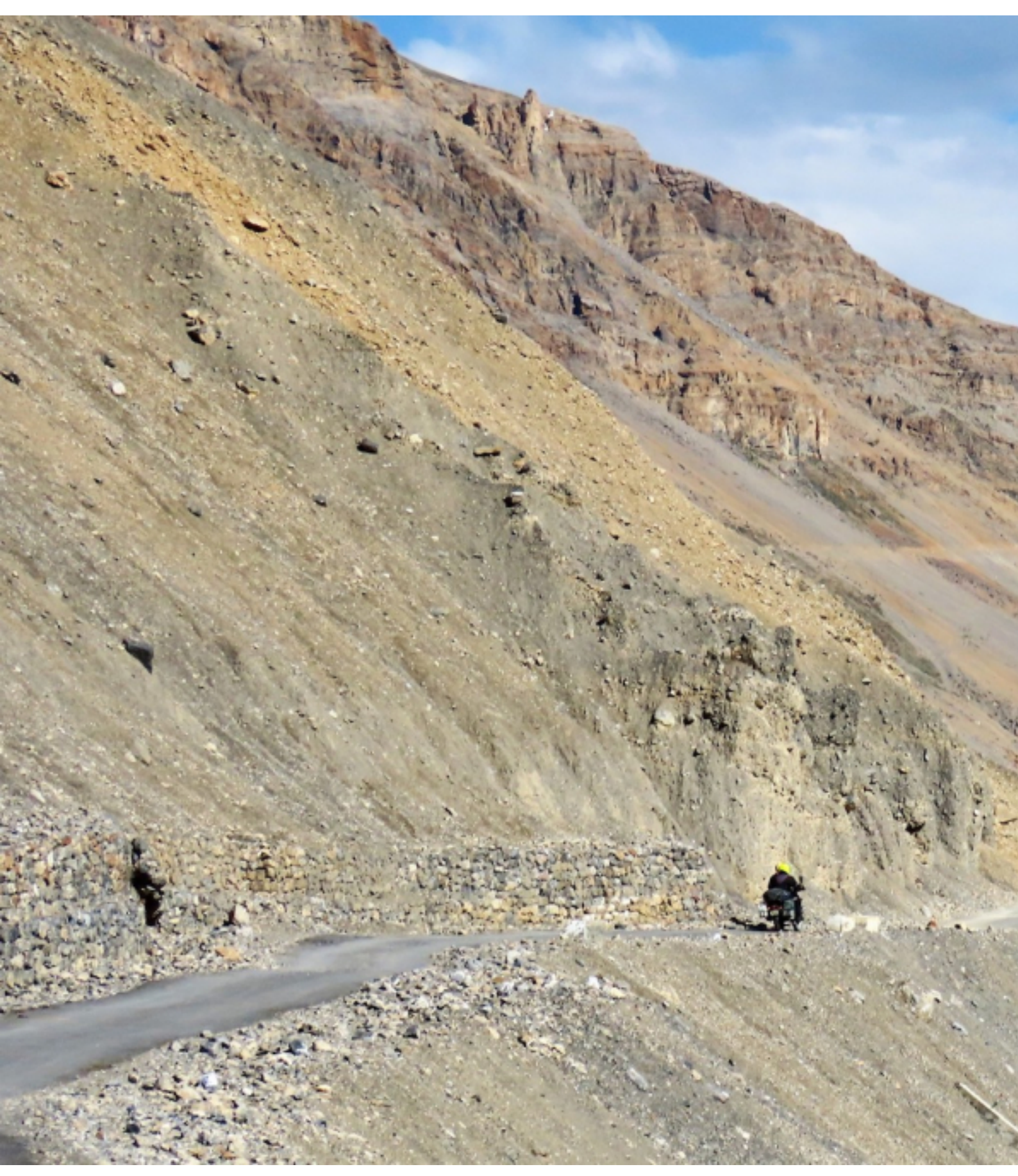
Motorcycle dual-purpose and Adventure Himalaya adventure