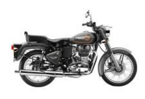
Bullet 500 + $0.00