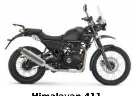
Himalayan 411 + $150.00