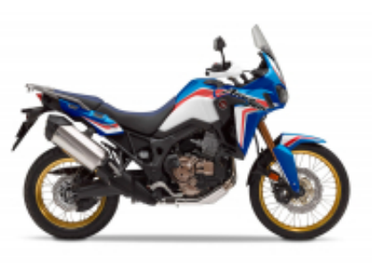
Africa Twin CRF 1000 L + $450.00