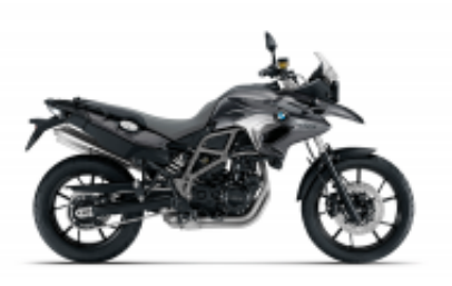
F 700 GS + $0.00